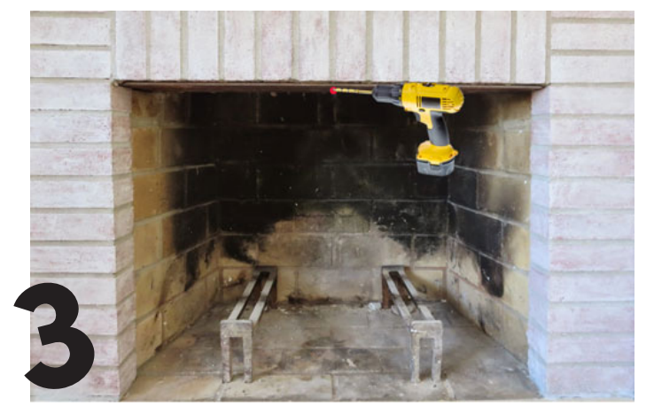
Pre-drill a hole at that 1/2 way point up through the center of your lintel iron. (The metal bar at the top of your fireplace).