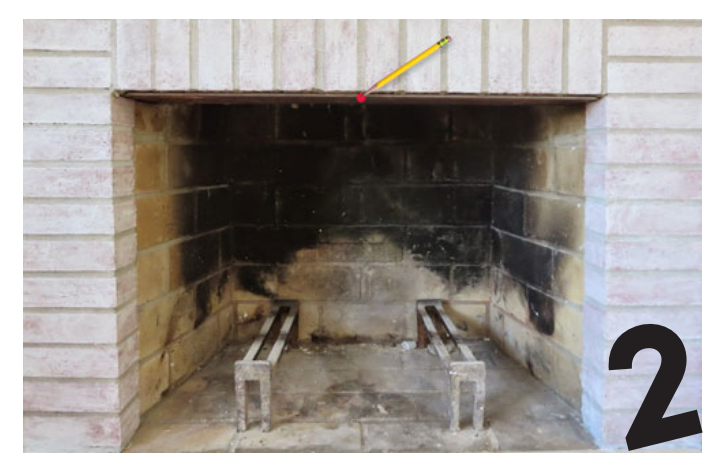
Divide that measurement in half and mark your fireplace at that point.