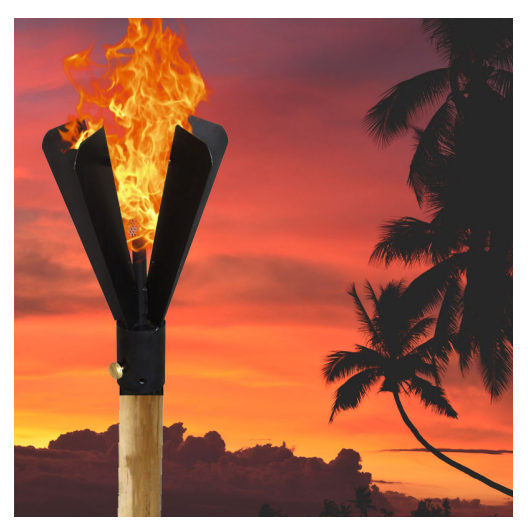
Black Fin Tiki Torch