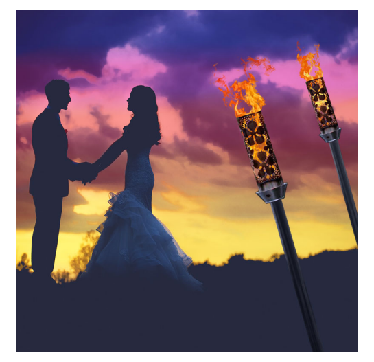
Plumeria Tiki Torch