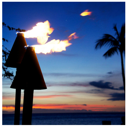
Black Cone Tiki Torch