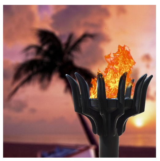
Malumai Tiki Torch