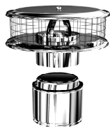
WeatherShield® Model WSA, WSC, and WSM

Important: WeatherShield® chimney caps fit inside round flues or inside Adapter collar. Adapter instructions are included separately with the Adapter and may also be found on page 17.