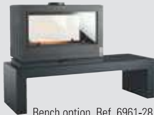
Bench option. Ref. 6961-28 W 1600 x H 450 x D 550 mm

W 910 X H 635 X D 481 mm Flue diameter 180 mm. Top flue. (Comparative tables: p123)