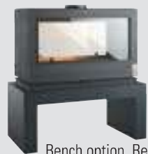
Bench option. Ref. 6961-31 W 1000 x H 450 x D 550 mm

You no longer need to choose one side or the other. Aaron stove offers a double sided view of the fire. Placed directly on natural material such as stone or a bench, offered as an option, this wide vision welcomes large logs. Design: Jean-Philippe Dargent.