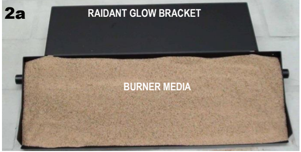
STEP 2: Fill the burner pan with the appropriate media as shown in figure 2a (sand for NG and vermiculite for LP) Install the grate over the burner pan. The front legs of the grate go around the burner pan and about 1" in front of the burner pipe as shown in figure 2b.

STEP 1: Figure 1a illustrates how the radiant glow bracket slides and rests on the back of the burner pan. For installation on burner pans without pilots center the bracket on the back of the burner pan as shown in figure 1b. For installation on burner pans with a pilot install the bracket on the back of the burner pan allowing 1" clearance around the pilot assembly as shown in figure 1c. For shallow fireplaces the back of the radiant glow bracket can be bent, using pliers as in figure 1d. The grate can then be pulled forward over the burner pan, as shown in figure 1e.