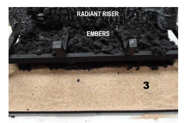
STEP 3: Stuff the embers under the Radiant Riser to fill the gap between the radiant glow bracket and the riser. Also use the embers to cover the visible surface of the radiant bracket as shown in figure 3.