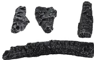
Charred Chip Kit