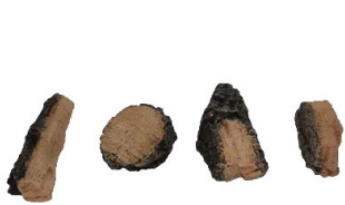
Bark Chip Kit