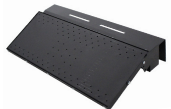
System 4 Burner

Available with Manual Safety Pilot, On/Off Remote, Variable Remote, Millivolt, and Electronic Ignition