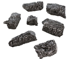
Fiber Char Chunk Kit