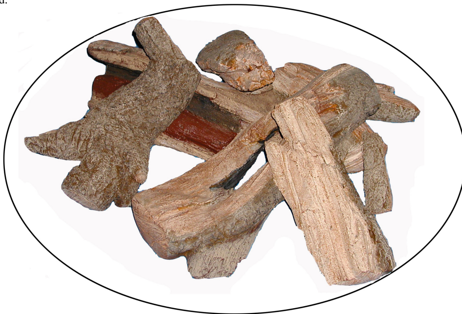
30" diameter log stack – Step 2