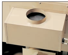
Draft diverter may be rotated for horizontal or vertical installations.