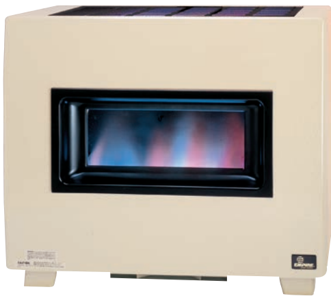
▲ RH-50B Visual Flame Heater (Vent Pipe Not Shown, Heater Must Be Vented)

Radiant and convection heat circulates the warmth while the blower (optional on the RH-50C and RH-65C) places warm air at floor level to give "barefoot" comfort throughout the winter season. The hydraulic thermostat needs no outside electricity assuring reliable, round-the-clock comfort. Each unit can be installed near any wall with access to a conventional vent.