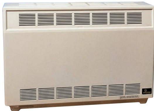
▲ RH-35 (Vent Pipe Not Shown, Heater Must Be Vented)

Ideal for medium to large rooms, each unit can be installed anywhere there is access to a vent. Housed in a durable, textured, powder-coated, beige cabinet, these room heaters look as good as they work for years.