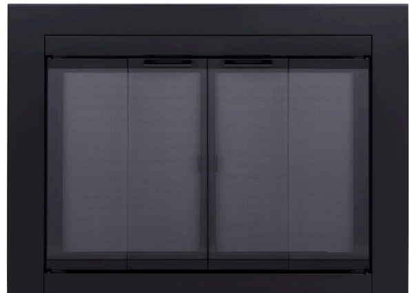
Matte Black Finish